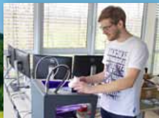
Software test on devices