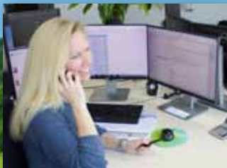
In the customer talk

Favored education: technical college / commercial college