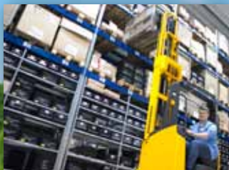
Storage in the high bay