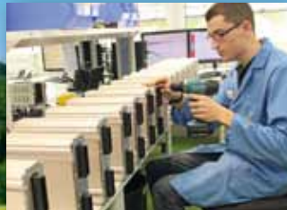
In the production