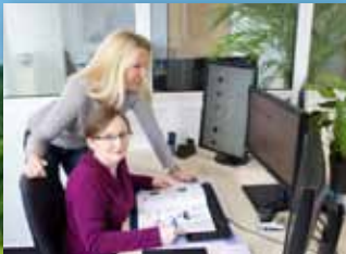
In the commercial area

We also offer interested students and trainees to do an internship with us.